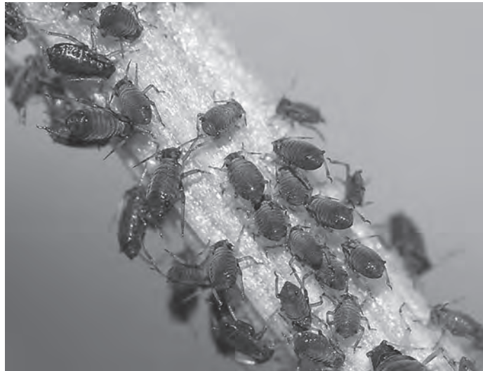
Photographer: Joaquim Alves Gaspar, May 2010

(a) Use this information to draw a food chain in the space below.